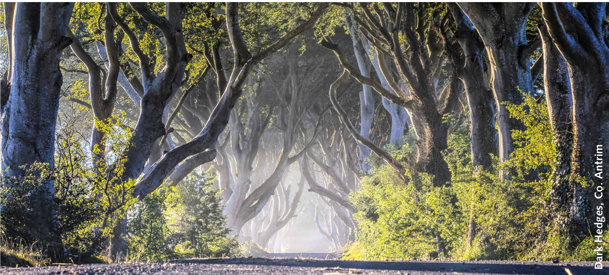
Dark Hedges, Co. Antrim

to build a compelling tourism destination, with appropriate sustained investment levels that continually builds knowledge, relevance, appeal and differentiation with target ROI consumers.