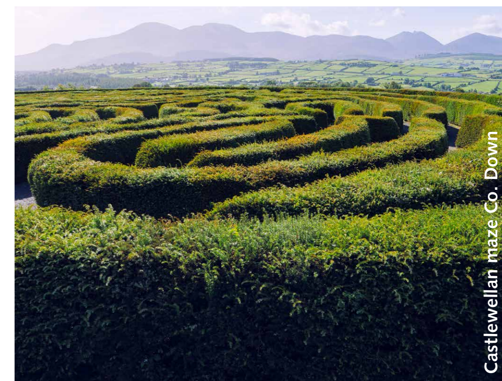
Castlewellan maze Co. Down

While many of the factors that have constrained performance will be challenging to overcome, they are not insurmountable. Having defined these key challenges NI can now take them head on, deploying strategies designed to strengthen competitiveness, build consumer relevance and increase overall destination appeal.