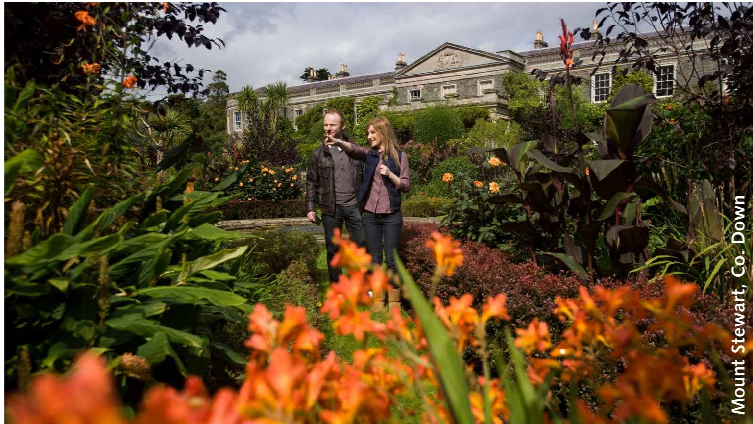
Mount Stewart, Co. Down

NI has a broad range of appealing, unique and differentiated products and experiences, with more currently under development. The challenge is now to improve standout and integrate these products and experiences in a way that will delight the ROI consumer.