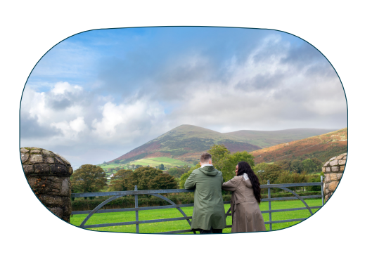
Belfast - w/c 4th March.