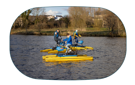
Mournes & Strangford - w/c 19th February.