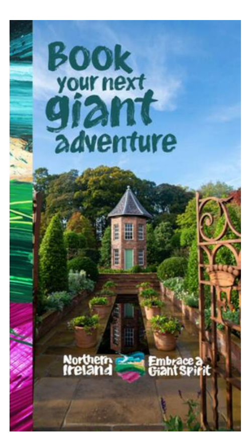
Social Media Story Template (available from content pool)

Download our <u>Content Calendar</u> now and create engaging content on your own channels aligned to these themes that we can curate and share.